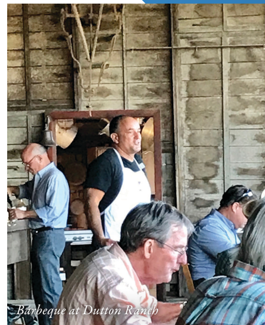
Barbeque at Dutton Ranch

I would personally like to thank all the members who attended our events and a big thank you to the above hosts!