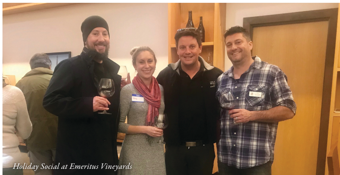
Holiday Social at Emeritus Vineyards